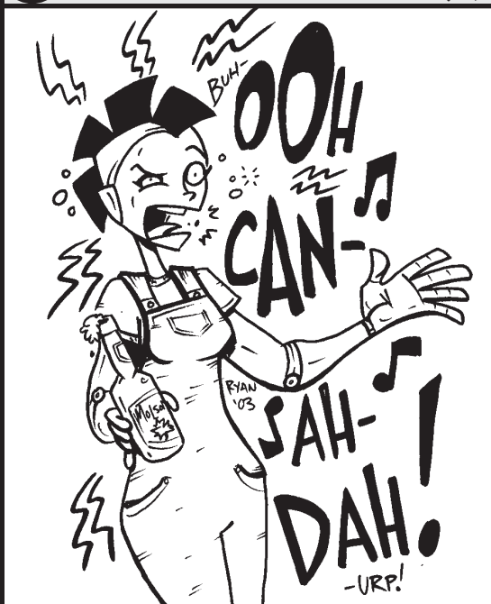
BURP ANY NATIONAL ANTHEM!